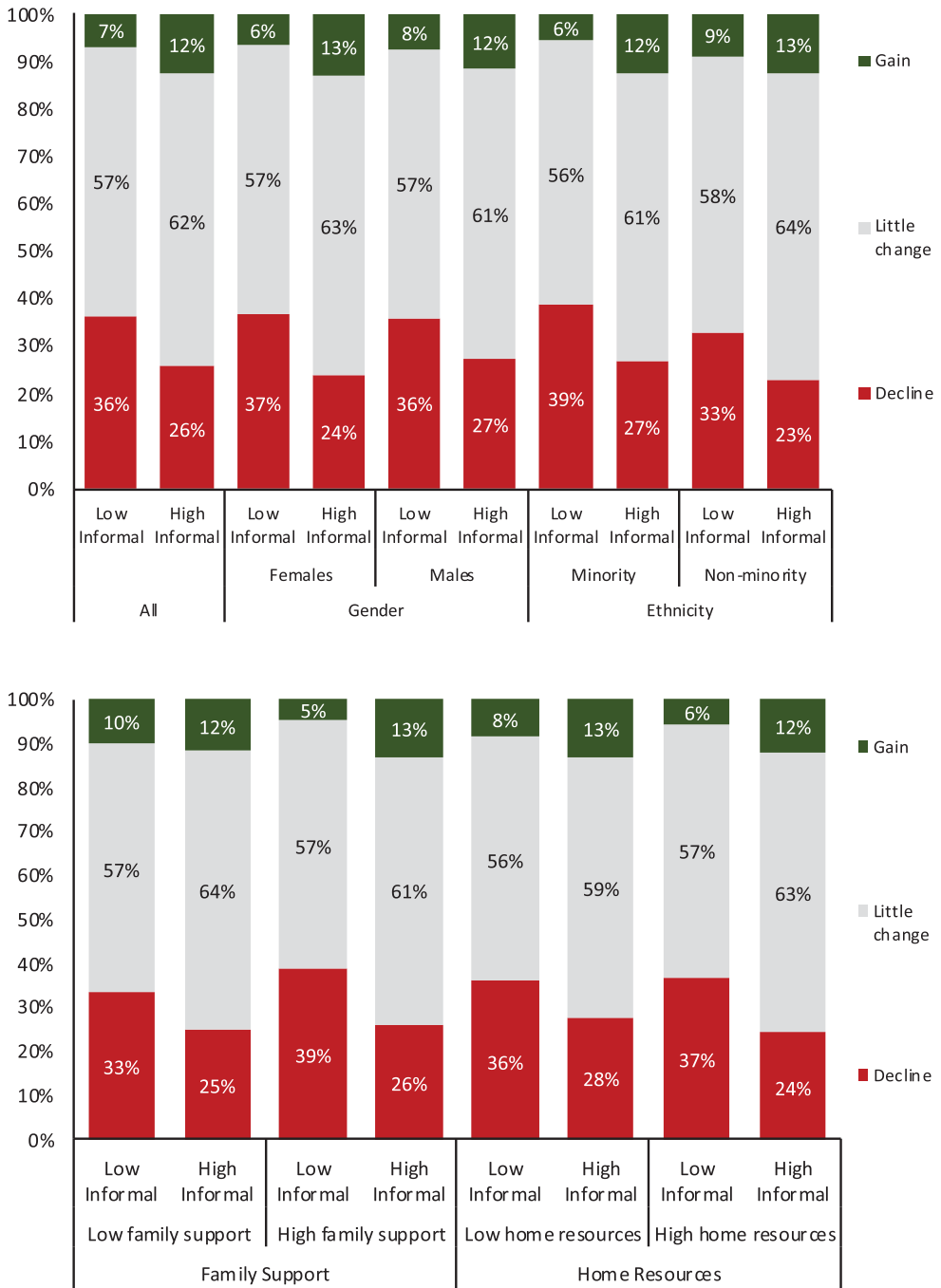
Figure 2. Frequency of gain, little change, and decline in fascination across sixth grade separately by students with low or high levels of recent informal science experiences, overall and then separately by gender, ethnicity, amount of family support and amount of home family resources.

Figure 2 shows the relative frequency of each category separately for children with high vs. low levels of informal science participation (using a median split). While many children