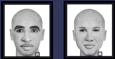
(MacLin & Malpass, 2001)

TEST: Old/New recognition • 40 studied faces • 40 new faces